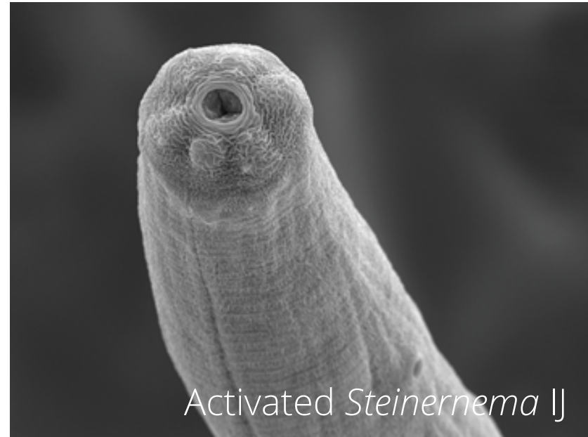
Activated Steinernema IJ

“Natural products from Photorhabdus and Xenorhabdus and their role in nematode symbiosis and insect killing”